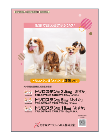
Veterinary pharmaceuticals (CA<sup>2</sup>) TRILOSTANE TABLETS "ASKA"