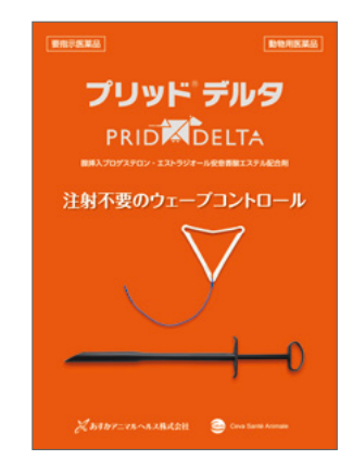
Veterinary pharmaceuticals (PA<sup>1</sup>) PRID DELTA